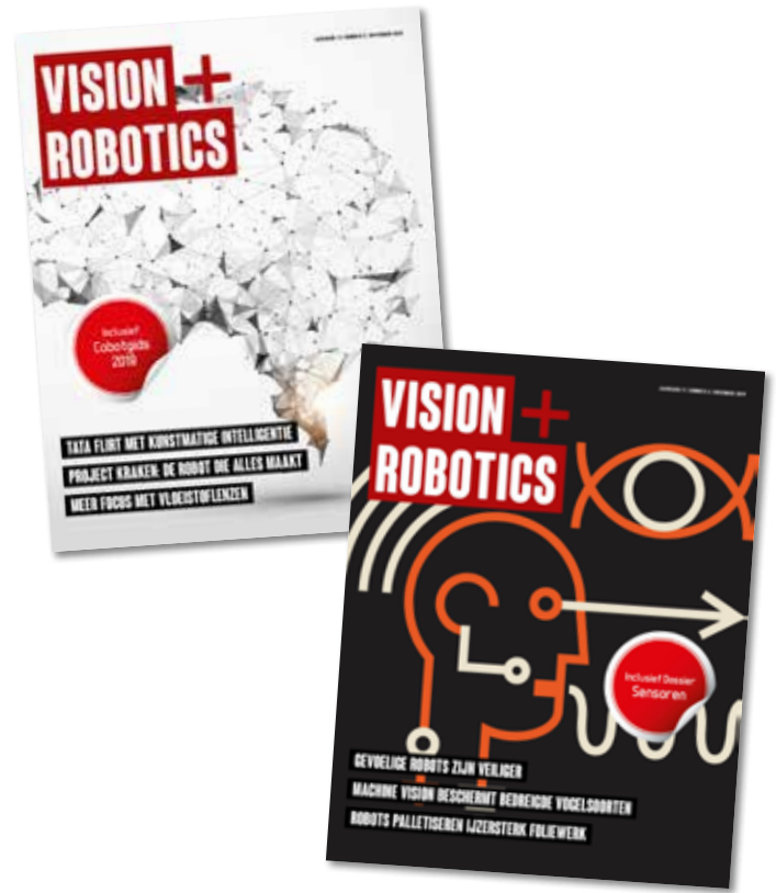
Vision & Robotics Stats

Vision & Robotics offers various options for online and to advertise offline. For example advertisement, branded content, online bannering or online advertorials. This one media card offers you an overview of the standard opportunities. Customization is of course also possible. Our Media Advisor is happy to help you determine one appropriate (multimedia) campaign to your achieve marketing objectives.